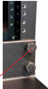
Shown with optional accessories

Bolts with tapped holes; No "nuts" required for assembly